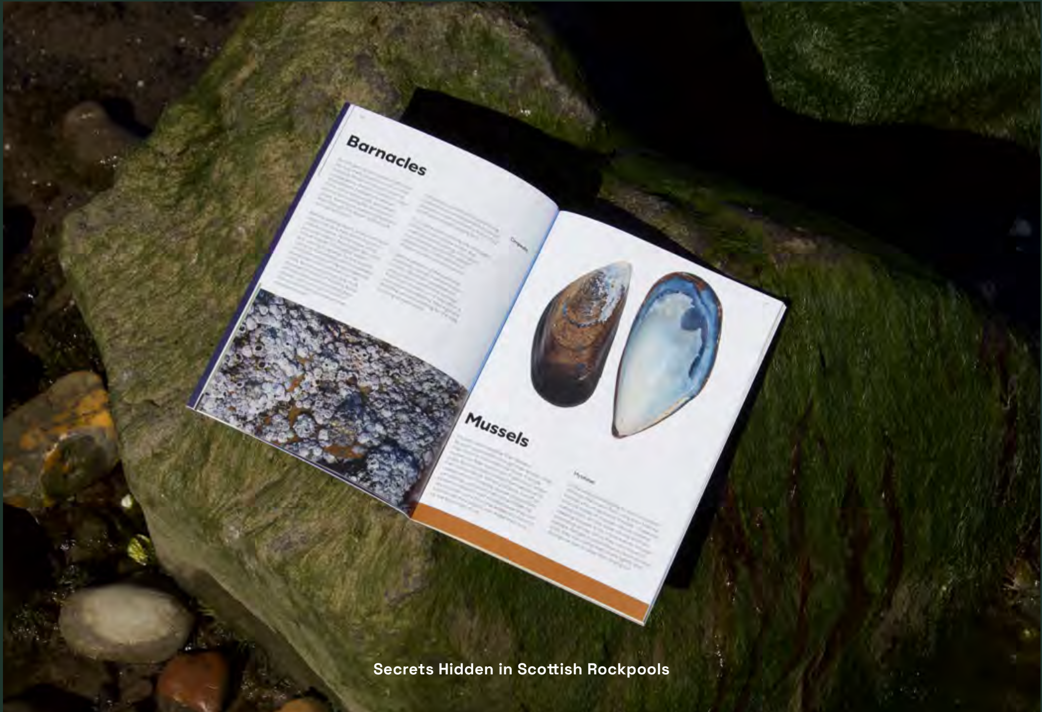
Secrets Hidden in Scottish Rockpools