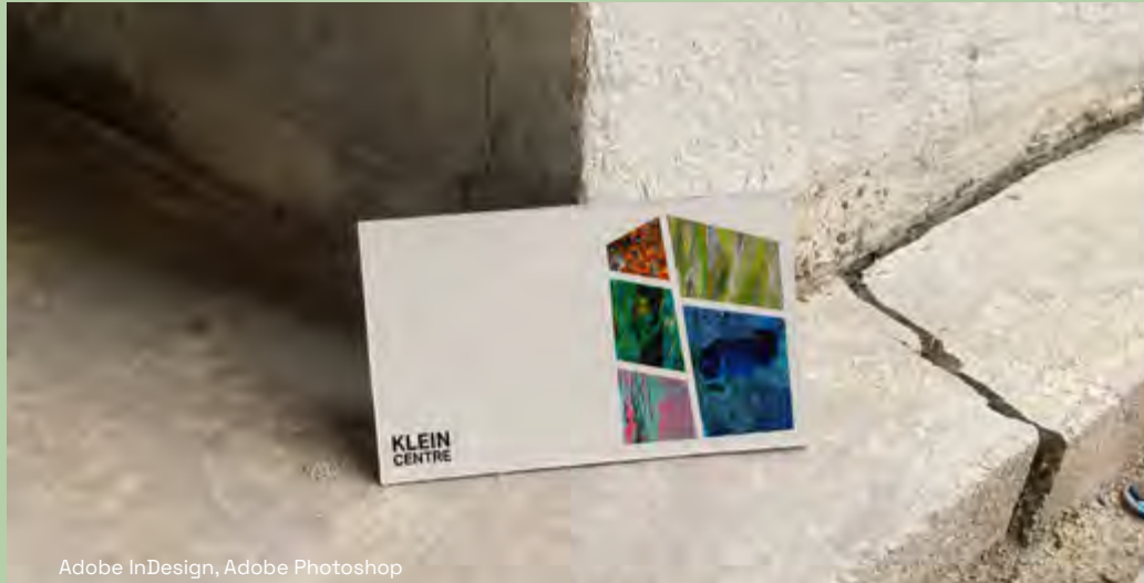
Adobe InDesign, Adobe Photoshop