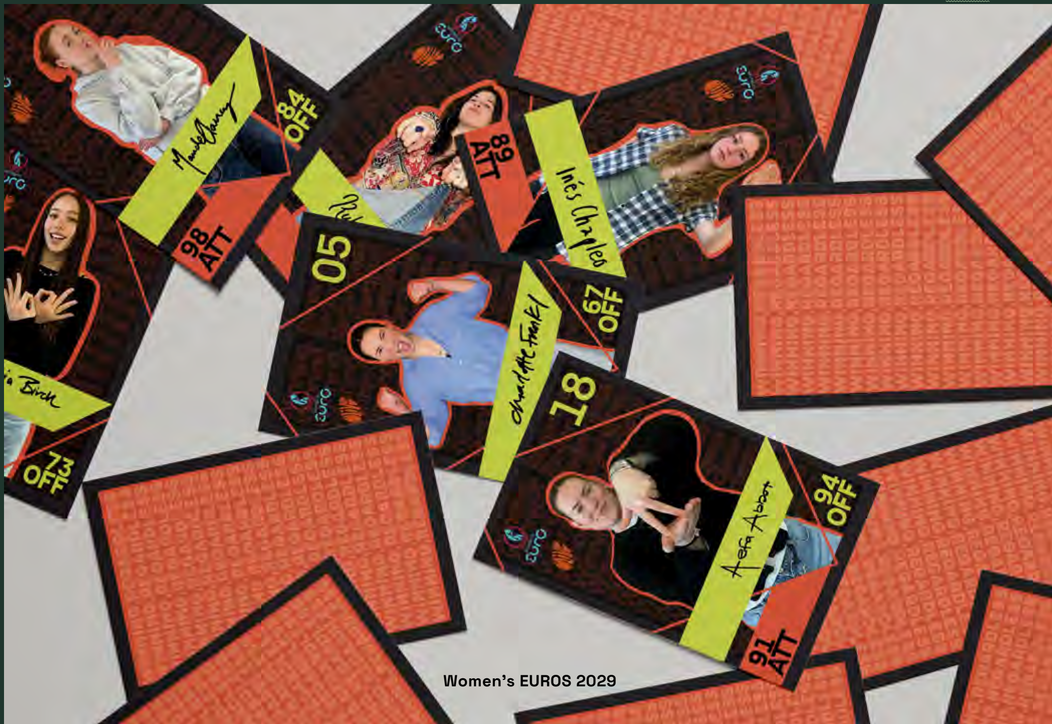
Women's EUROS 2029